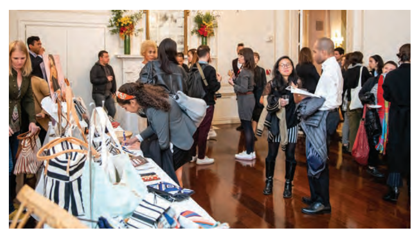
YPA PANEL: THE FUTURE OF ETHICAL FASHION AND EMPOWERING WOMEN, OCTOBER 30, 2019 AT AMERICAS SOCIETY.

Young Professionals of the Americas (YPA) is an international network that provides a platform for young professionals in their 20s and 30s to connect around the latest trends in the Americas through its New York City, Miami, and Washington D.C. chapters. Members come from various nationalities and represent a diverse spectrum of professional sectors, including venture capital and finance, fashion, government, non-profit, design, consulting, law, and the arts. Membership includes exclusive access to panels, discussions, networking, and social events, such as talks with government officials and industry leaders, private gallery tours, and happy hours. Visit www.as-coa.org/young-professionals-americas for more information.