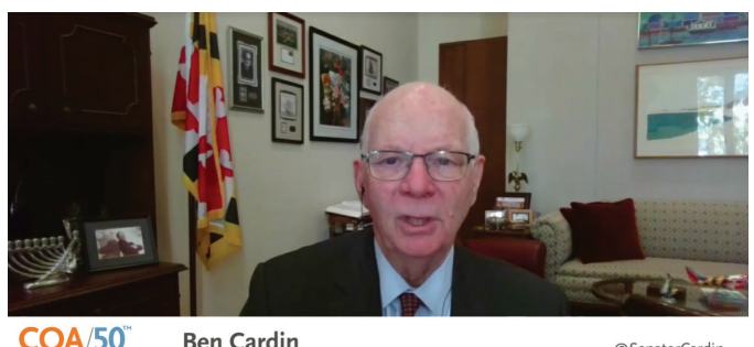
COA/50 WASHINGTON CONFERENCE ON THE AMERICAS U.S. Senator (D-MD)