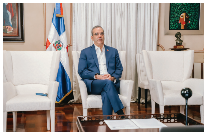
President of the Dominican Republic Luis Abinader giving remarks, October 7, 2020