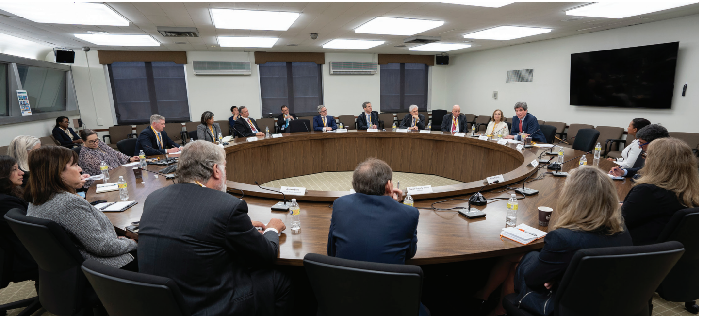
Washington Conference on the Americas pre-luncheon meeting with U.S. Under Secretary of State Jose W. Fernandez, May 3, 2022.

Offering more to our members than ever before, the Council is now a hybrid organization. Using emerging technology and growing expertise, our digital expansion has enhanced what we offer to our members across the globe. More than virtual meetings, the Council has developed innovative ways to connect our members to a growing list of leaders of new emerging spaces and familiar ones, while offering unparalleled opportunities to engage with change makers from across the globe.